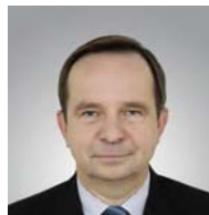
Władysław Ortyl (PiS)