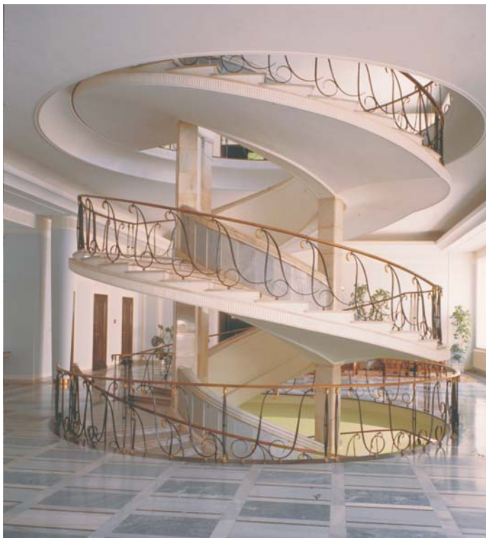
Hall and Spiral Staircase