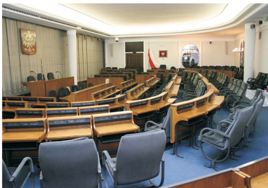
General view of the Senate Chamber, 2005

The Senate's present debating chamber was created by joining three conference rooms, thus obtaining an area of 220 square metres. It was not an easy task to fit a chairman's table, a rostrum, 100 amphitheatre seats for the senators, and around 40 places for people taking part in the deliberations as guests or for various official reasons into such a confined space. The chamber's designation created additional problems, given the shortage of space. A new ceiling with semicircular relief moulding had to be constructed, to neutralize the dimensions of the rectangular chamber, which was twice as long as it was broad. Most of the wiring for the lighting, air-conditioning and so on was concealed behind