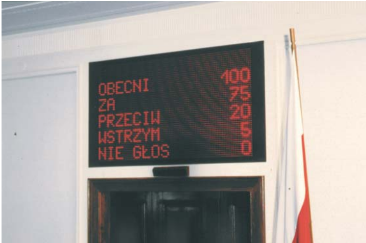
Results of the electronic voting